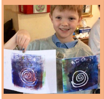
This term the children have been exploring clay, printing, stencilling and colour as part of their Art projects and they look forward to showcasing their work in the art exhibition later this term.