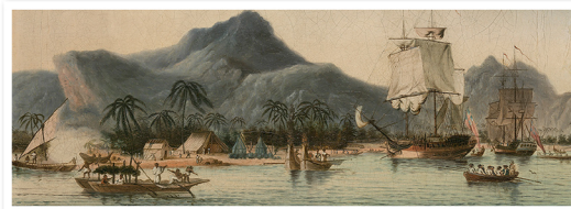
HMS Resolution and HMS Discovery

In 1776, Captain Cook went on his final voyage. He sailed on the HMS Resolution again and the HMS Discovery travelled with him. He was looking for a route between the Atlantic and Pacific Oceans. He visited the Hawaiian Islands, where he was killed.