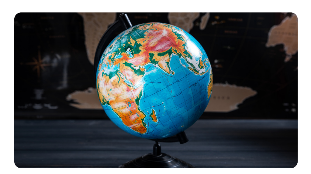
We live on a planet called Earth. A 3-D model of Earth is called a globe.

Read these interesting facts about the world with a parent, carer or teacher.