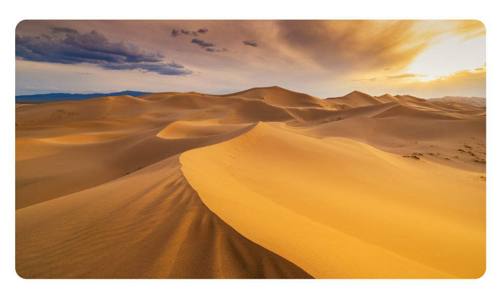
On Earth, the climate and weather changes depending on location. Some places are very cold, some are very hot and some are wet or dry.