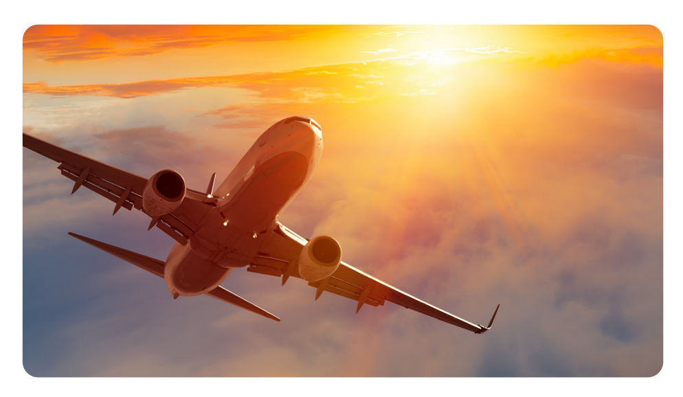
We can travel between places on Earth by using vehicles, such as cars, buses, trains, boats and aeroplanes.