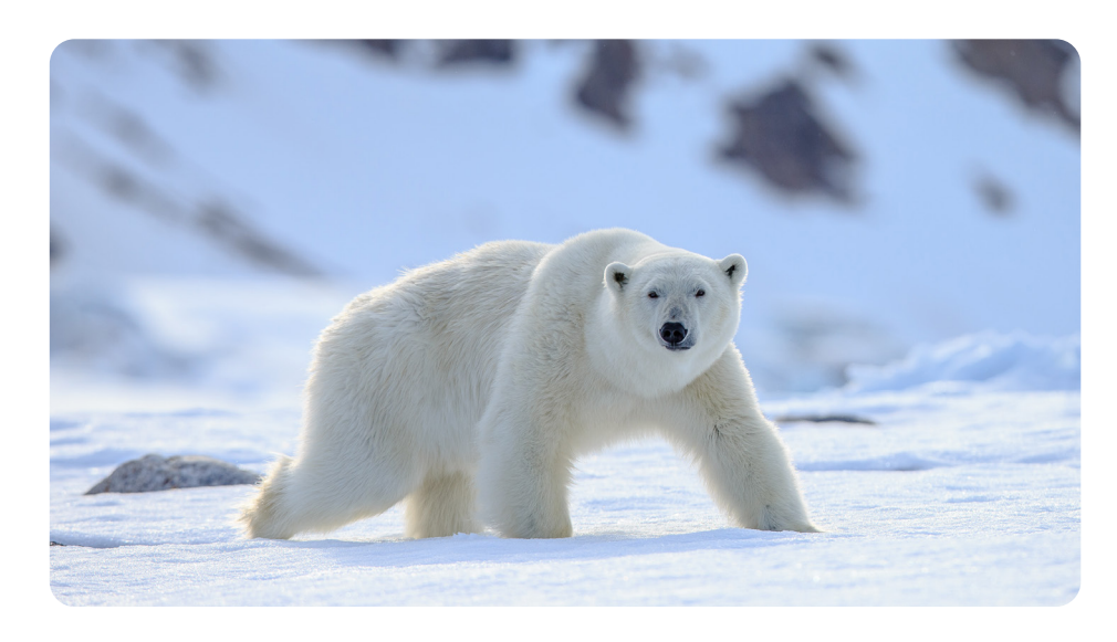
A habitat is the place where an animal or plant lives. Every habitat has a different group of animals or plants that live there.