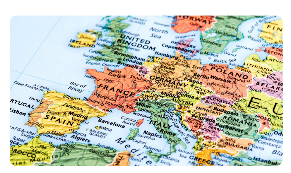
The land on Earth is surrounded by seas and oceans. Maps show a 2-D image of land, seas and oceans.