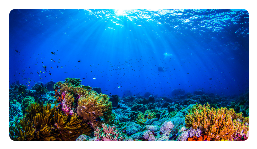
Habitats include oceans, mountains, forests, savannahs, woodlands, rivers and deserts.