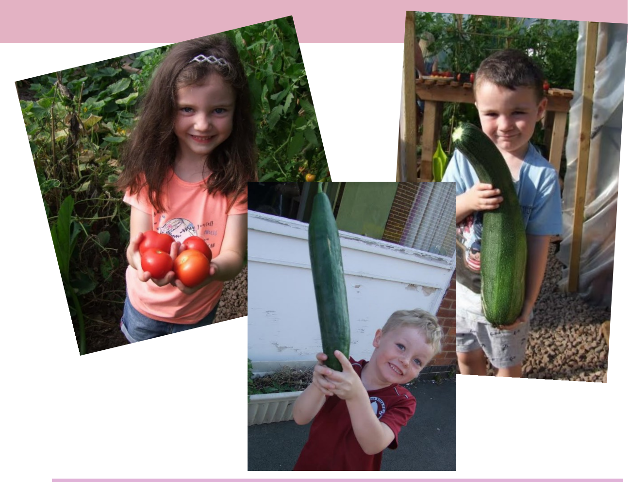
There have been some welcome additions to the Flying Falcons this summer too!

We are so proud of our children and their success with their amazing vegetable competition entries for the Long Whatton Show! The children have loved growing the vegetables this year and we can't wait to see if we can grow some even bigger entries for next year!