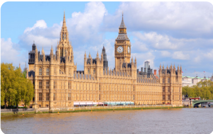
Houses of Parliament

London is a city. It is the largest settlement in the United Kingdom. Over eight million people live there. The River Thames is the main river that runs through the city. Tourists visit London to shop and see its famous landmarks.