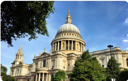
St Paul's Cathedral