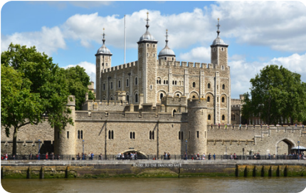
Tower of London