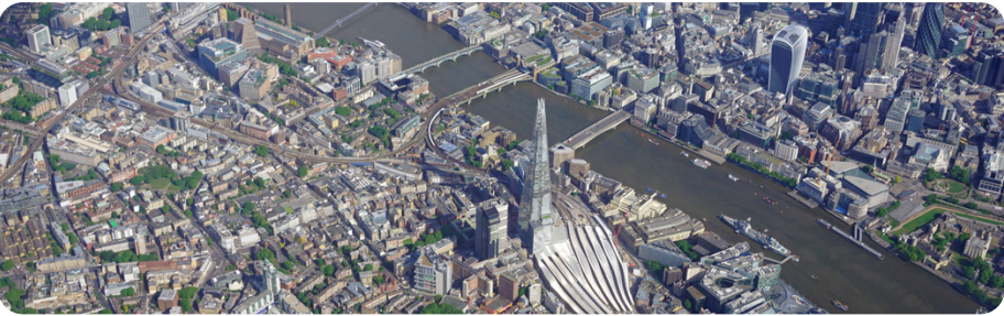
Aerial view of London

A city is a large, busy settlement where lots of people live and work. A city usually has a cathedral, a river, important buildings and offices where people work. There are lots of things to see and do in a city. There are many shops and restaurants to visit.