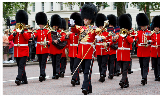
military marching band

A marching band is a group of musicians who perform their music while they are marching. They usually play brass, woodwind and percussion instruments. The musicians often wear a uniform and perform in parades or at special events. They usually march in lines and are led by a conductor. They work together to keep in time and follow the beat of the music.