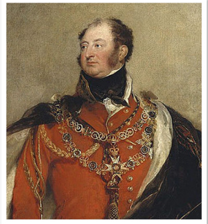
Portrait of Prince Frederick

The Grand Old Duke of York is thought to be about Prince Frederick, Duke of York and Albany, who was the second son of King George III. In 1794, Frederick was asked to lead a huge army against the French. Frederick was not a good leader, and he lost the battle. Frederick decided to learn how to be a better leader. He worked hard, and his army went on to win many battles.