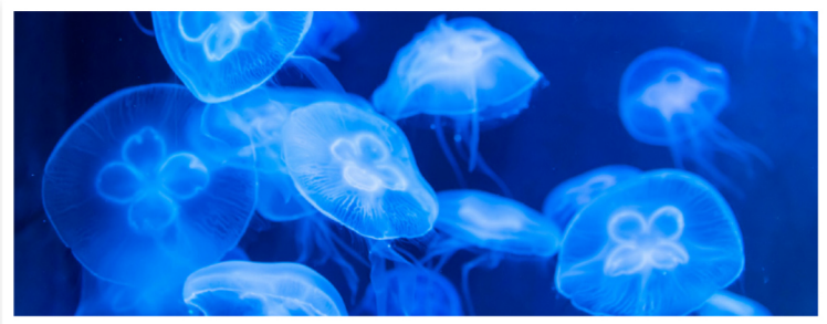
Jellyfish displaying bioluminescence

Some marine animals have chemicals in their cells that make light or bacteria that live on them and produce light. This is called bioluminescence. Bioluminescence can be used as defence, camouflage, to attract prey or to see in the dark. The most common colours of bioluminescence are blue, green and red.