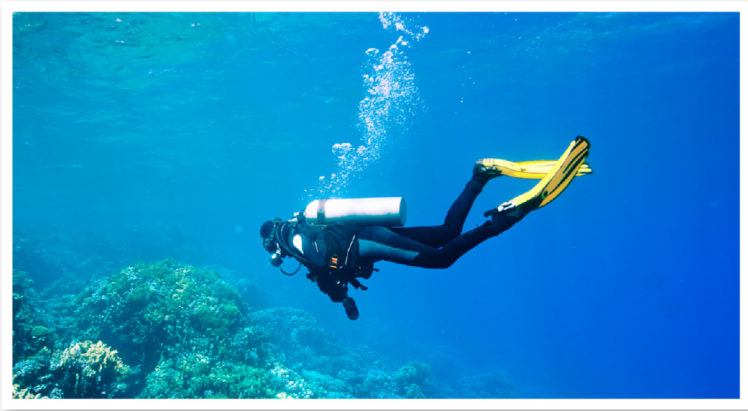
Deep sea diver using an aqua-lung to breathe

Ocean diving can be dated back to 4500 BC when people in the coastal areas of Greece and China dived for food. Cousteau’s invention of the aqua-lung meant divers could take air with them, spending more time under the water and going deeper than ever before. Cousteau used the aqua-lung to explore and film the underwater world more freely.