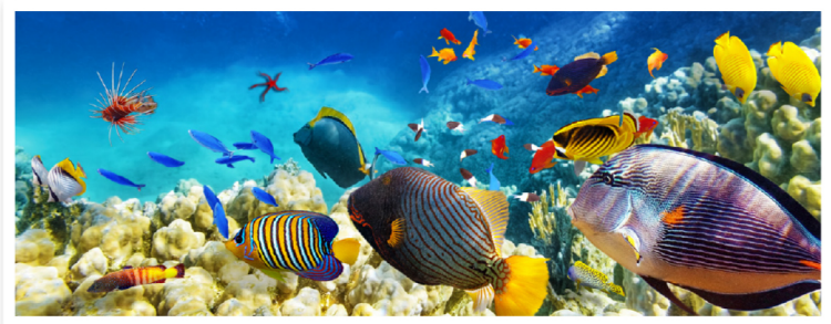
Tropical fish in a coral reef

Corals are marine invertebrates that live in large groups called colonies. Some species produce a hard exoskeleton that forms into a coral reef. The Great Barrier Reef, on the north-eastern coast of Australia, is the longest and largest coral reef in the world, with over 600 types of coral. Corals are at risk of being destroyed by climate change, pollution and consumers.