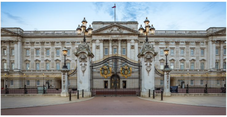
The Queen lives at Buckingham Palace.

Queen Elizabeth II is the current monarch of the United Kingdom. She was born in 1926 and became Queen in 1952. The Queen is famous across the world.