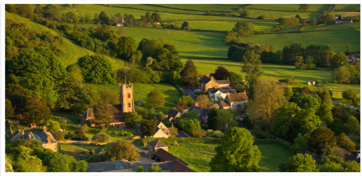
Village of Corton Denham in Somerset

The countryside is a rural area outside of a town or city. Less people live and work in the countryside than in a city.