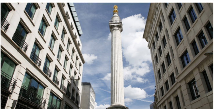
Monument to the Great Fire of London

The Great Fire of London was a significant event in London's history. It began in a bakery on Pudding Lane on Sunday 2nd September, 1666. Many buildings were destroyed including St Paul's cathedral. Today, a monument stands where the fire began.