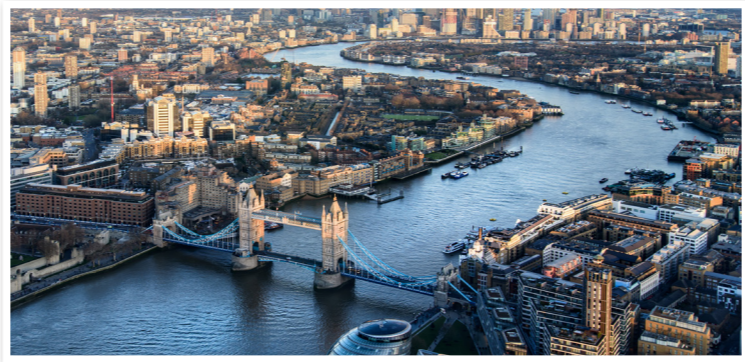
City of London

A city is a large urban settlement with lots of traffic and tall buildings. There are many shops and restaurants to visit there.