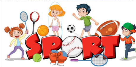
Our Cross Country Runners!

We were thrilled to hear that we won the Spirit of the Games Award —a brilliant achievement and a true reflection of the teamwork and sportsmanship shown on the day!