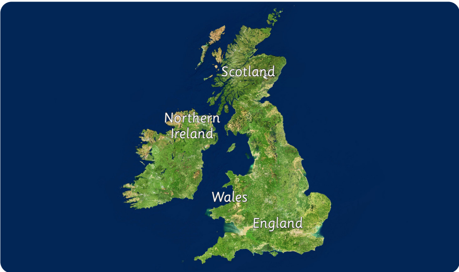
The United Kingdom is made up of four countries. These are England, Northern Ireland, Scotland and Wales.