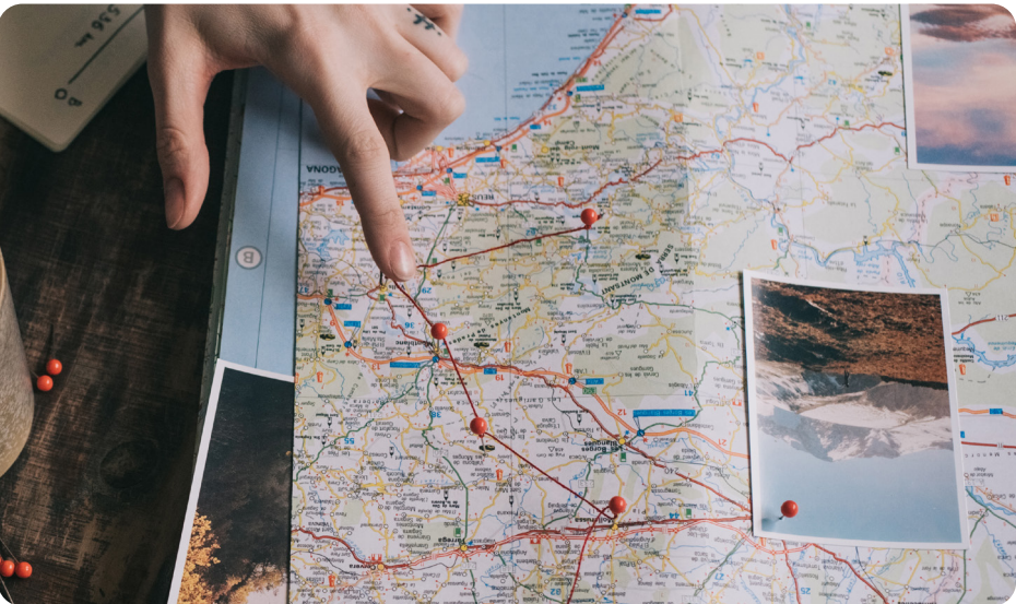
A map can help us to plan a journey.