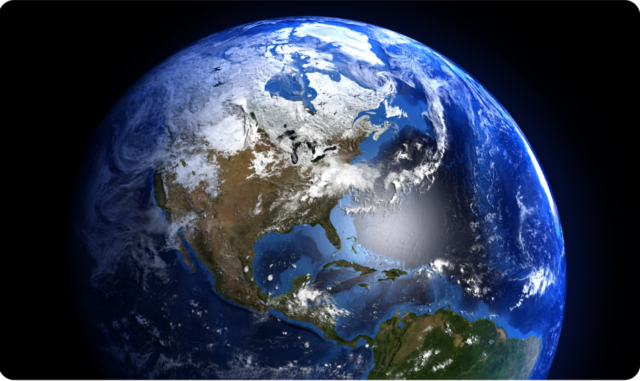
We live on a planet called Earth.