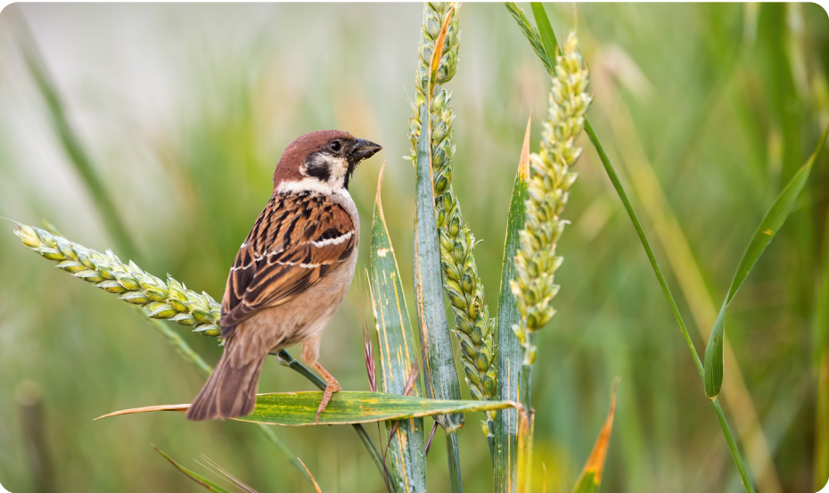
Living things, including people, animals and plants, share the environment.