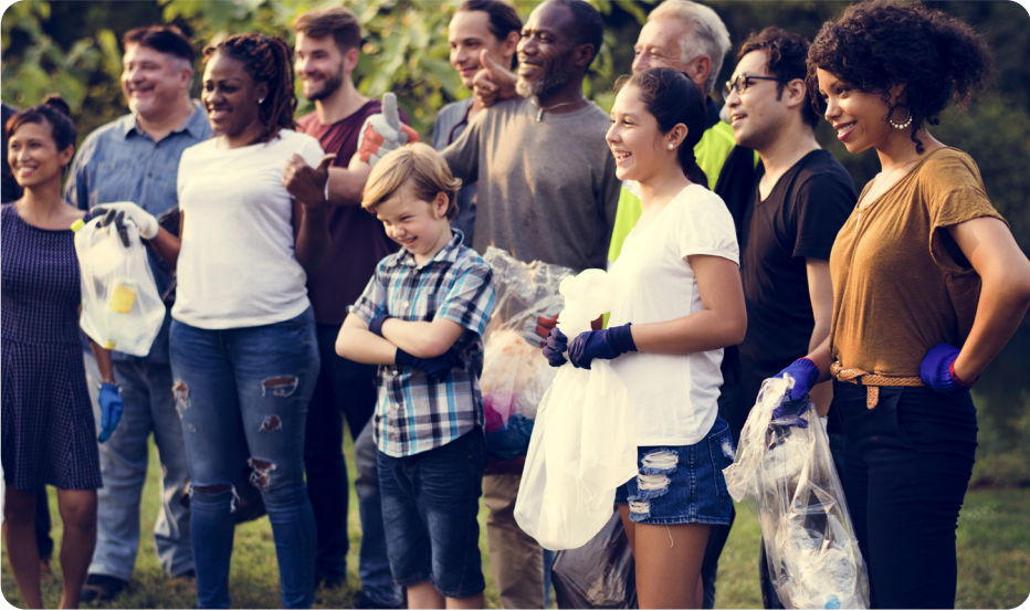
A community is a group of people. We are all members of different communities, including our family and school.