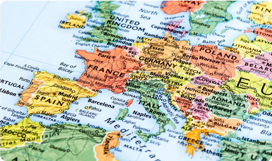
Maps show 2-D images of land, seas and oceans.