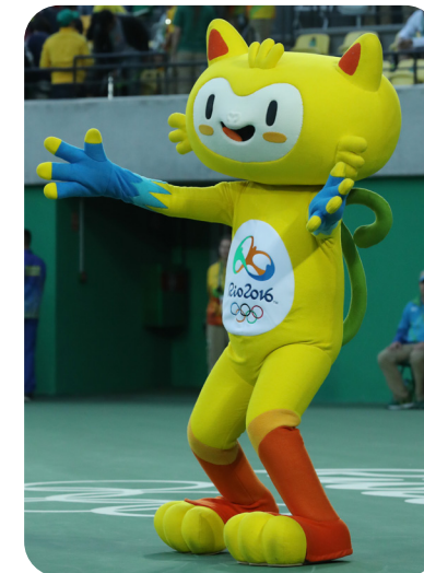
2016 Olympic mascot

A mascot is an animal, person or object owned by a sports team to bring them luck. It can be a person on the side lines at a sports event dressed in a costume. They encourage supporters to cheer for their teams. There is a new mascot for each Olympic Games.