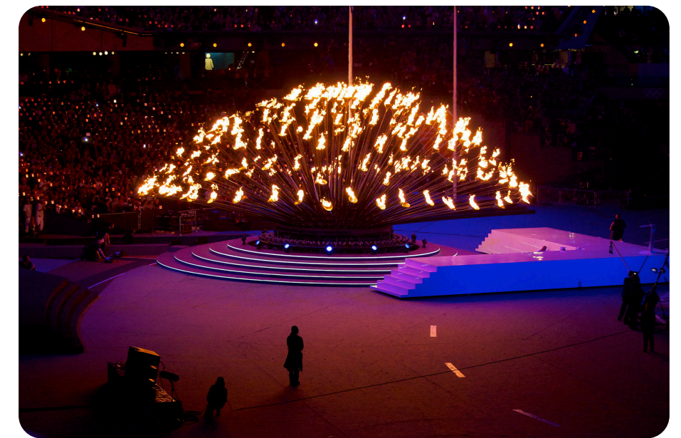
Olympic torch at the 2012 Olympics in London

The Games begin with an opening ceremony inside a stadium. There is one for the Olympics and another for the Paralympics. The ceremonies feature athletes from each country parading with their country's flag and dancers perform entertaining routines. The Olympic or Paralympic flag is raised and a special Olympic torch is lit.