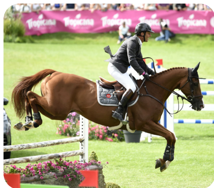
individual show jumper

There are many different Olympic sports. Athletes compete against each other either as individuals or in teams. They try to achieve the highest score, fastest time or furthest distance. Athletes in a team must work together to achieve a shared goal.