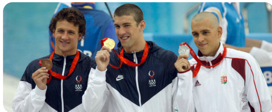
Medal winners at the 2008 Olympics in Beijing

Female and male athletes compete against each other in different sports. Winners receive a medal. A gold medal is awarded for first place, silver for second place and bronze for third place.