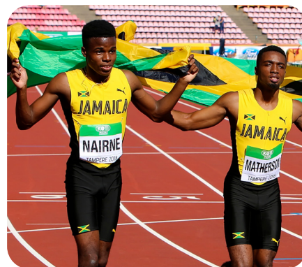
Jamaica's team kit

Athletes in a team wear the same kit to show that they belong to the same group and that every member is important. Team kits worn by Olympic athletes include the colours and sometimes symbols or shapes taken from a country's flag.