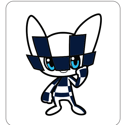
2020 Olympic mascot